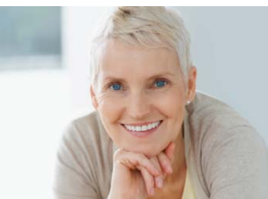
A Guide to Your Health Benefits